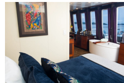
Jr. Commodore Suite