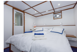
Standard Deck Cabin