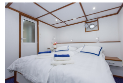
lower Deck Cabin