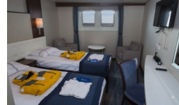
Deluxe Balcony Suite