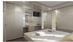
Main deck cabins