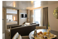
Prestige Stateroom Deck 4