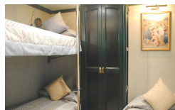
Tween Deck Economy. From