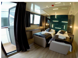
Upper Deck VIP Cabin with balcony