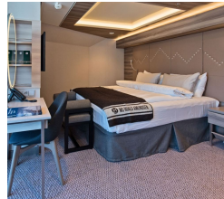
Polar Outside. From