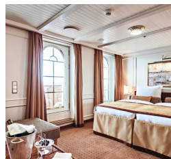
Category B: Junior suites with balcony. From