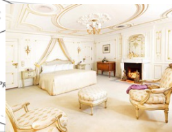
Category A. From