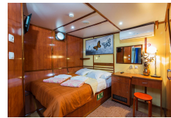
Main deck cabin