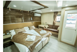
VIP Balcony Cabin