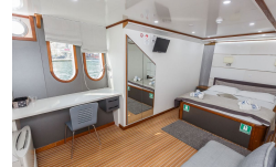
Main Deck Cabin - Twin Cabins