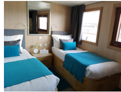
Main Deck (Twins)