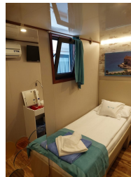
Sun Deck Cabin