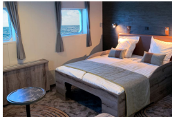
Triple Porthole Twin Deluxe