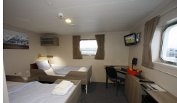
Twin Porthole Twin Window