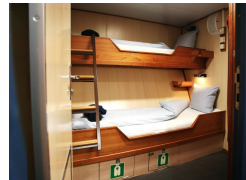
Twin Private Porthole