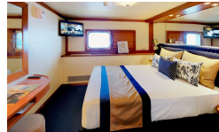
Orchid Cabins - Twin Share