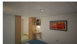
Category 4. From