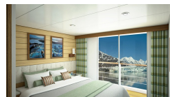
Category 5. From