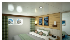
Category 3. From