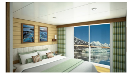
Category 5. From