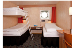
Cat 1A - Quad