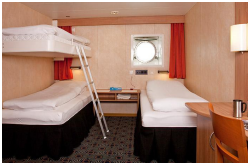
Cat 2 - Twin