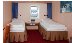
Cat 4 - Twin