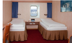
Cat 4 - Twin