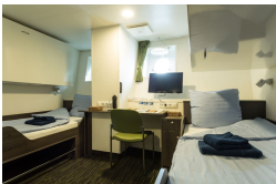
Twin Deluxe Twin Porthole Twin Window