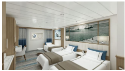
Balcony Stateroom Category A