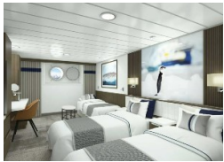
Aurora Stateroom Triple Share