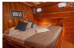
Superior Twin Cabin