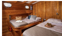
Grand Master Cabin