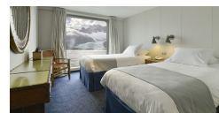
Cabin AAA Superior