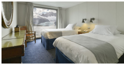
Cabin AAA Superior