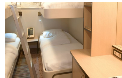
Polar Outside. From