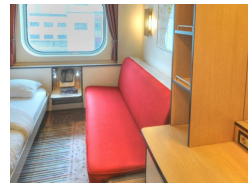
Polar Inside. From