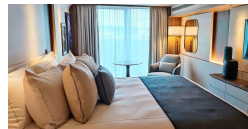
Deluxe Suite Deck 7