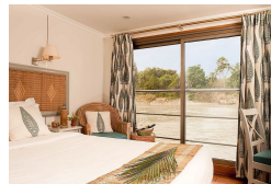
Main deck cabin for single occupancy