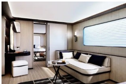
Mistral Prestige Stateroom