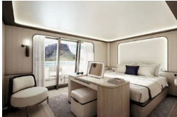
Mistral Junior Suite