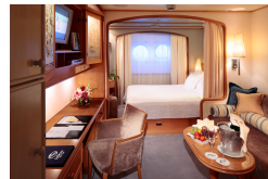
Yacht Club Stateroom Deck 3