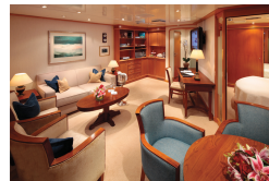
Yacht Club Stateroom Deck 2