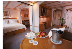
Commodore Suite Deck 3