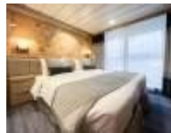
Studio Single Veranda Stateroom