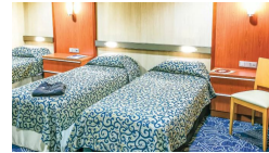
Cabin Category 10