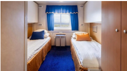
Cabin Category 4