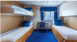
Cabin Category 2