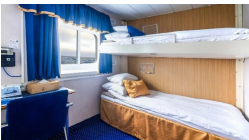
Cabin Category 3