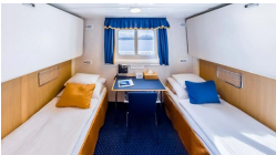
Cabin Category 5