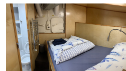
Twin / Double Cabin En-suite Twin Cabin