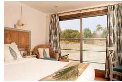
Main deck cabin for single occupancy