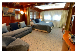
Amundsen Deck Standard Suite