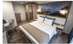
Balcony Stateroom - C Captain's Suite