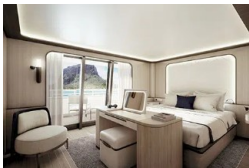
Mistral Junior Suite