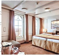
Category B. From