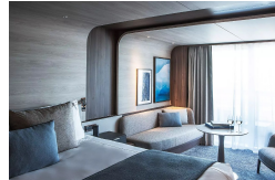
Deluxe Suite Deck 8