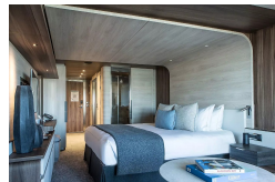
Grand Prestige Suite