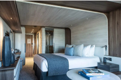
Grand Prestige Suite