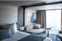
Deluxe Suite Deck 8