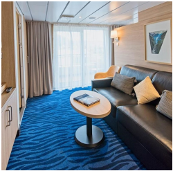
Polar Inside. From