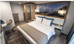
Balcony Stateroom - C Balcony Stateroom Superior Junior Suite