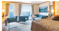
Category 7 - Suite with balcony