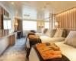
Owner's Suite Solo Panorama