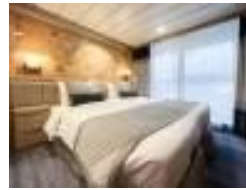
Studio Single Veranda Stateroom