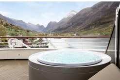
Prestige Deck 5 Suite