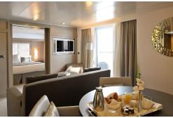
Prestige Stateroom Deck 4