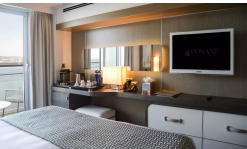
Prestige Stateroom Deck 5