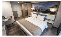
Balcony Stateroom - B