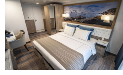
Balcony Stateroom Superior Captain's Suite