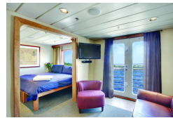
Jr Commodore Cabin