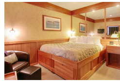
Jr Commodore Suite